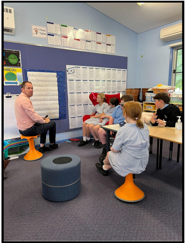
Top left: work taken from recent student writing lesson / Top right: shared discussion focusing on positive praise. Bottom left: making edits to improve writing / Bottom right: students are able to revisit the examples to further understand the changes and to try to use them as ways to effectively improve their writing.